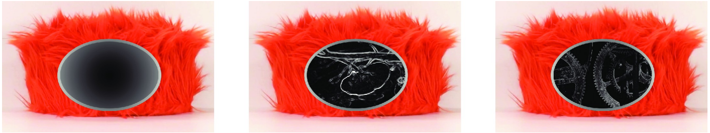
Fig 1. Example of the “X-ray” images that children were asked to choose between. The “Empty” insides are on the left, “Biological” in the middle, and “Mechanical” on the right.

https://doi.org/10.1371/journal.pone.0251081.g001